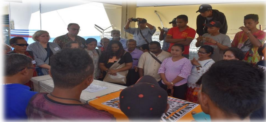
Photo 3: prayers of consolation at the airport that coincided with Global Ministries' South Asian Consultation in Kupang City (2018)