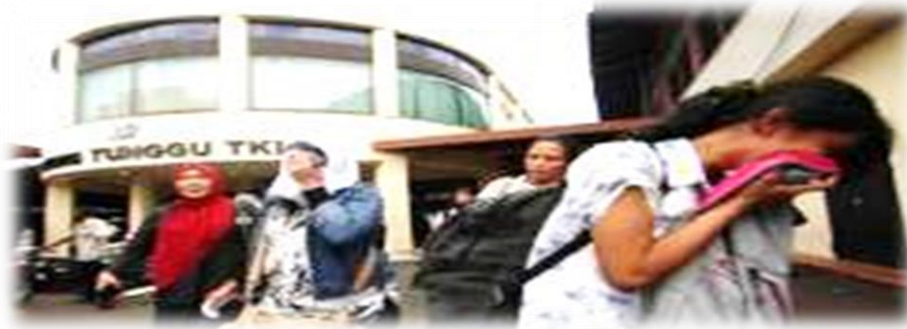
Photo 1: The anti human trafficking movement in NTT has been getting stronger after the Medan Case (2014)